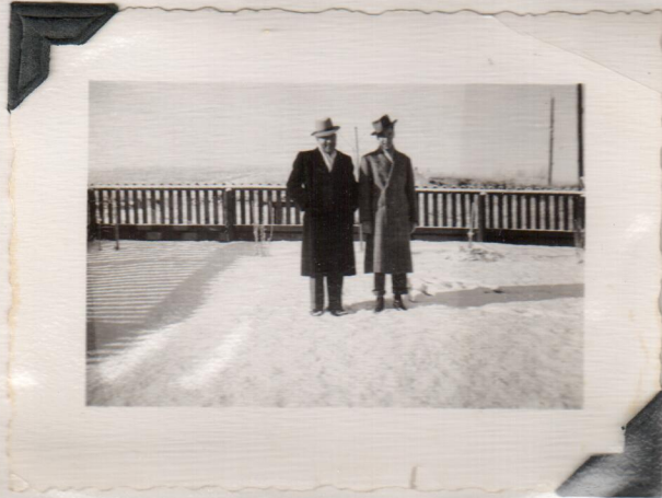
"Boxing Day 1942. The Anticipation of handing the old man a drubbing faded. Later."